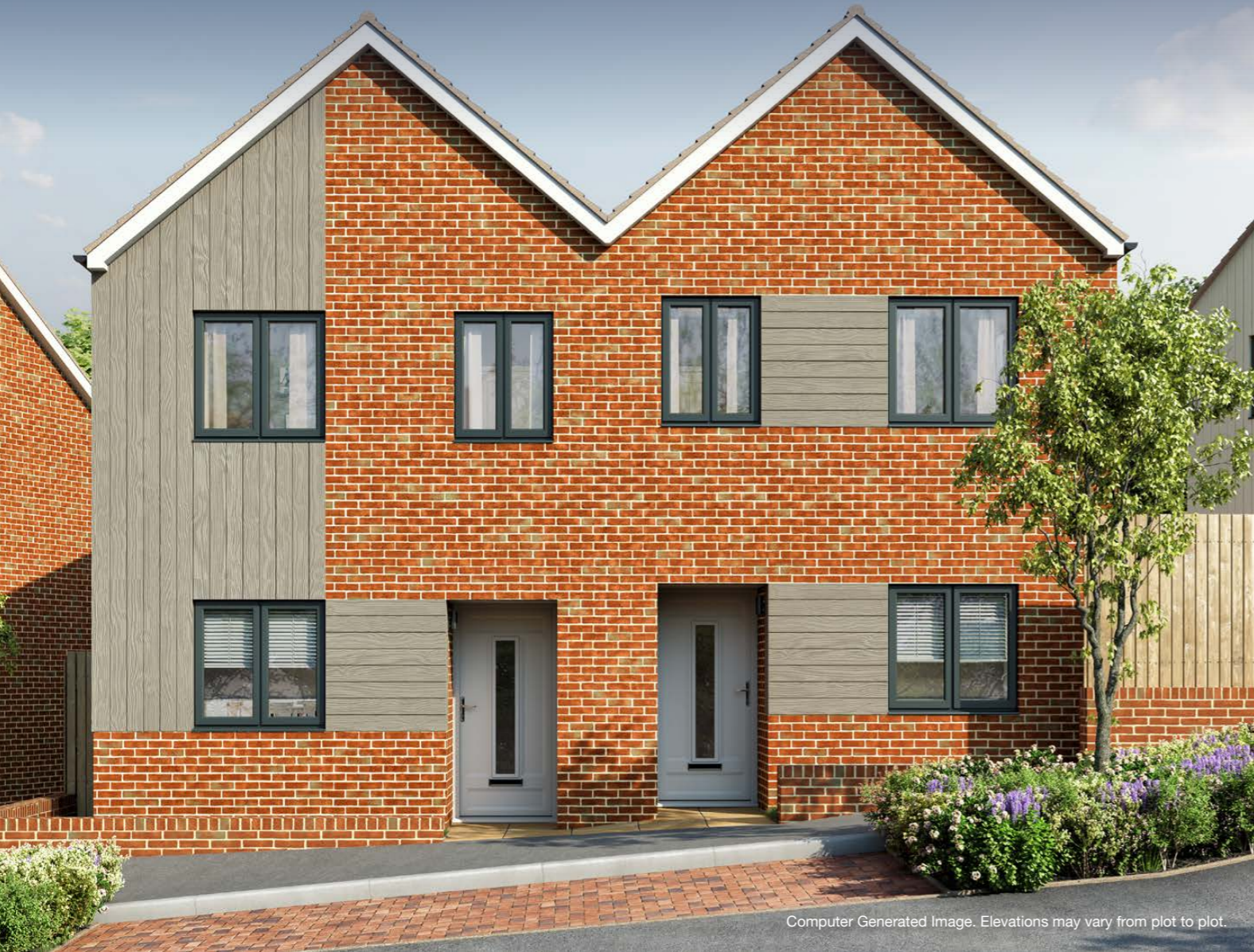
Computer Generated Image. Elevations may vary from plot to plot.

Market Sale 24, 26, 38, 39, 51, 52, 57, 58, 59, 60, 61, 63, 64, 65, 66, 67, 68, 69, 70, 74, 75, 80, 81 and 82